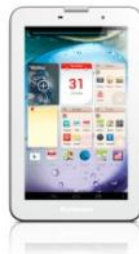
Lenovo 7 inch Tablet