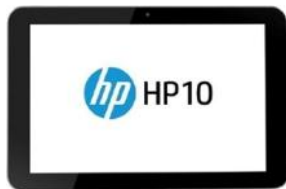
HP 10 inch Tablet