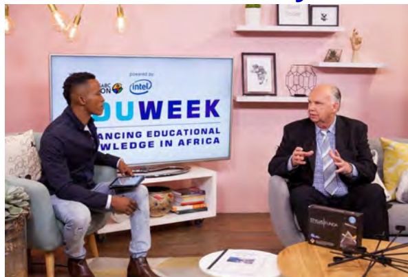
Teaching in the 21st century!

Access on: Computers, tablets & phones! Get what you need now!